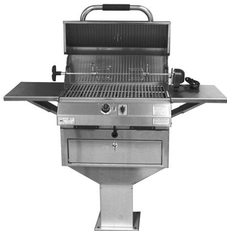
24" MODEL IS 4400-EC-336-PB-24