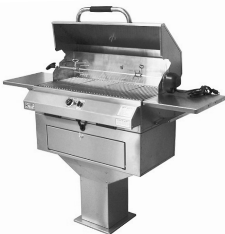
32" MODEL IS 4400-EC-448-PB-S-32 (SINGLE CONTROL)

Required Outlet: Nema 6-20R Receptacle 208/220 Volt 20 Amp receptacle 50/60 Hz