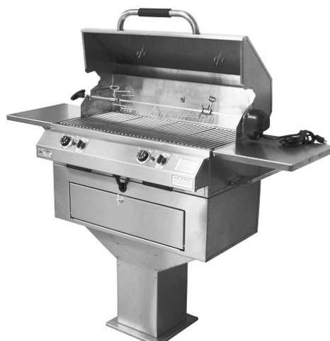
32" MODEL IS 4400-EC-448-PB-D-32 (DUAL CONTROL)

Required Outlet: NEMA 6-30R Receptacle 208/220 Volt 30 Amp receptacle 50/60 Hz